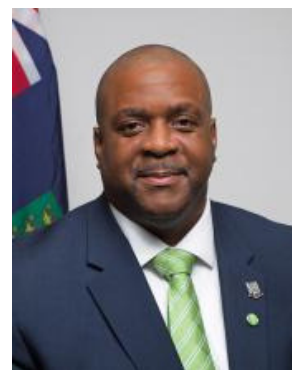
Photo: Honourable Andrew Fahie, Premier and Minister of Finance