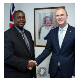
Photo (Lto R): Premier Honourable Andrew Fahie and His Excellency the Governor Mr. Augustus Jaspert